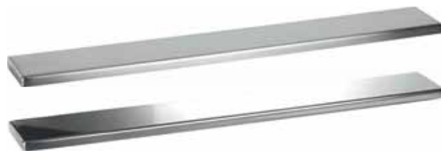
Choice of brushed or polished finish cover plate