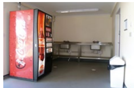
Project Completed 2010 OTL Floor showing it's versatility in a utility modular building for a large UK Holiday Group. Floor size 3145 x 1525 with complete slope to fall.